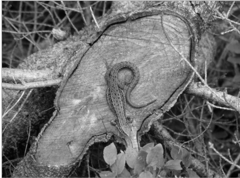
Fig. 18. Zootoca vivipara adult from Giupalău.