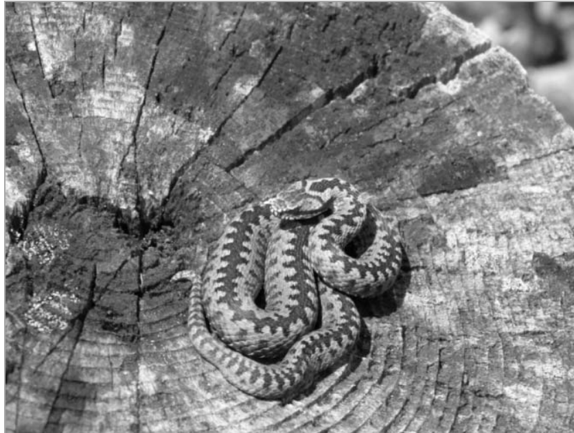
Fig. 20. Vipera berus adult from Rarău (Photo A. Strugariu).