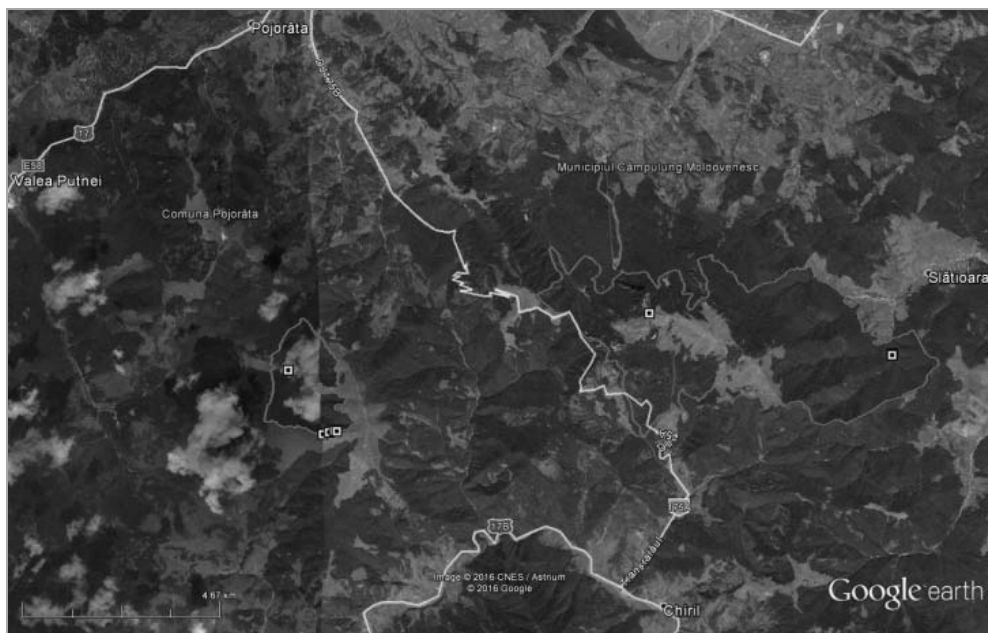
Fig. 7. Distribution of Ichthyosaura alpestris in the Rarău-Giumalău site – ROSCI0212.