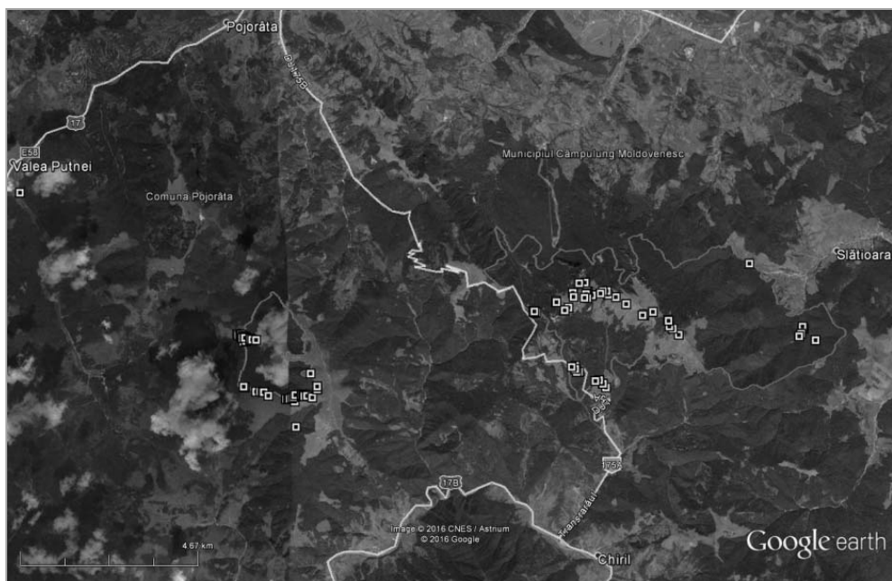
Fig. 19. Distribution of Zootoca vivipara in Rarău-Giupalău ROSCI0212.