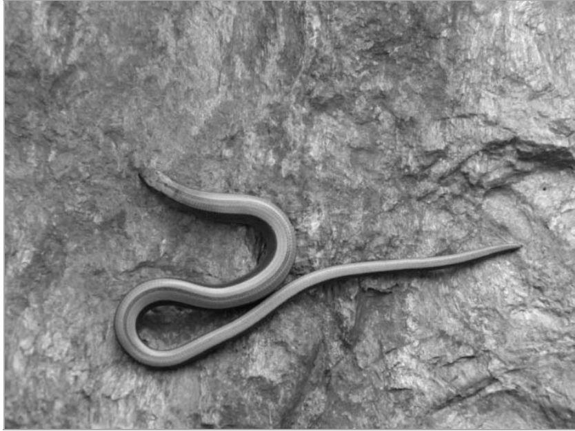
Fig. 14. Anguis colchica adult from Giupalău.