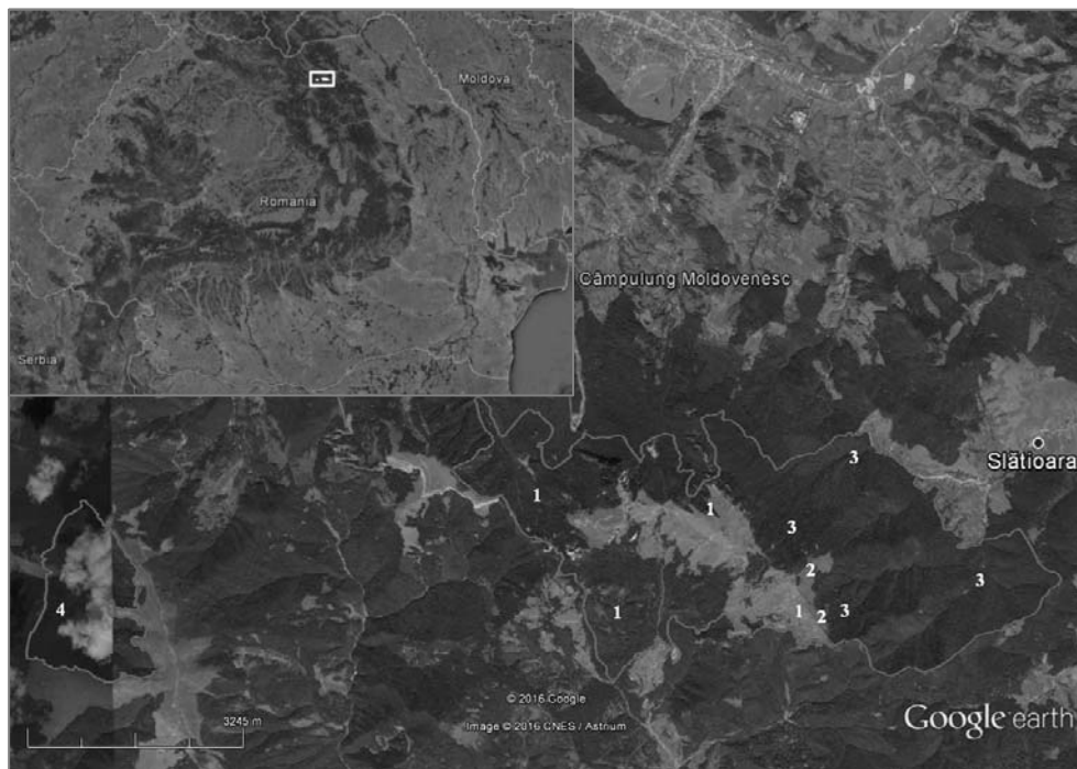
Fig. 1. Geographic position of Rarău-Giumalău ROSCI0212 (white rectangle) and its components (left perimeter – Giumalău, right perimeter – Rarău, 1 – Pietrele Doamnei, 2 – Fânețele montane Todirescu, 3 – Codrul secular Slătioara, 4 – Codrul secular Giumalău).

The study was carried out in two mountainous areas of Rarău and Giumalău, in Eastern Carpathians. The study area is represented by the Rarău-Giumalău Natura 2000 site – ROSCI0212 – (site coordinates: 47° 26' 53" N, 25° 33' 31" E), as confirmed in 2008. With an altitude between 819 m and 1710 m a.s.l., the site belongs to the alpine biogeographical region, it has 2547 ha, it is divided into two perimeters (Rarău and Giumalău), and includes several previously-designed nature reserves: Pietrele Doamnei (970.5 ha), Fânețele montane Todirescu (38.1 ha), Codrul secular Slătioara (1064 ha), and Codrul secular Giumalău (309.5 ha) [31] (Fig. 1).