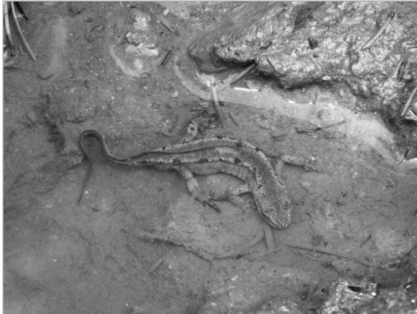
Fig. 4. Lissotriton motandoni adult from the Slătioara Forest.