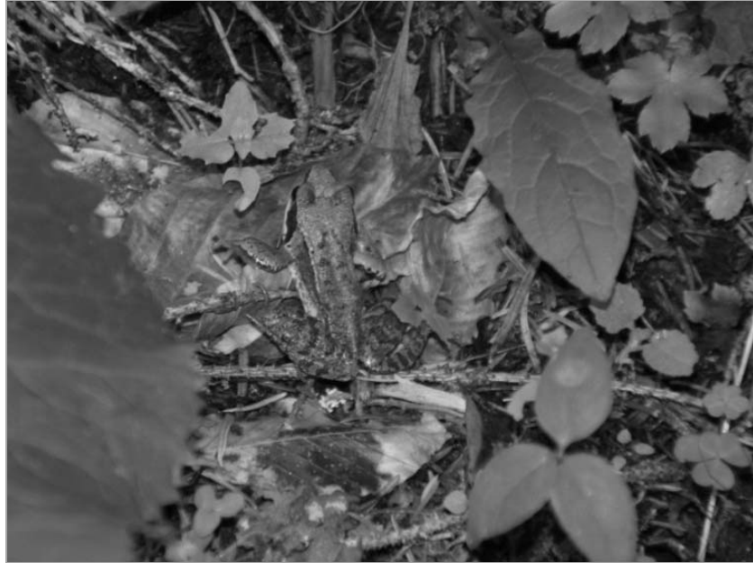
Fig. 12. Rana temporaria adult from Rarău (Photo A. Strugariu).