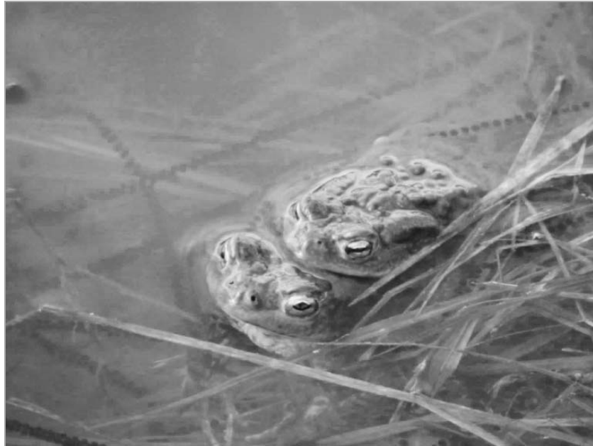
Fig. 10. Pair of Bufo bufo in amplexus and clutch – Rarău.