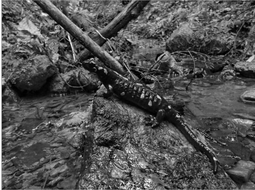
Fig. 2. Salamandra salamandra adult from Slătioara Forest.