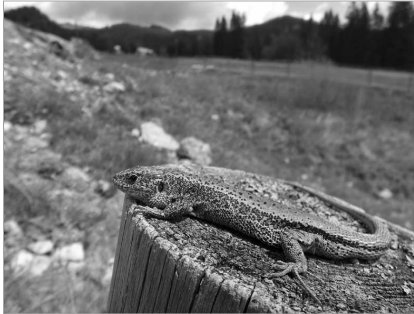
Fig. 16. Lacerta agilis adult from Rarău.